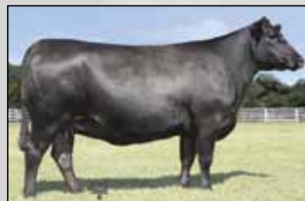
Bred Female, Vintage Angus Ranch, CA

Tehama Bando 155 GAR Precision 1680 9J9 GAR 856 N Bar Emulation EXT GAR EXT 4927 GAR Traveler 641